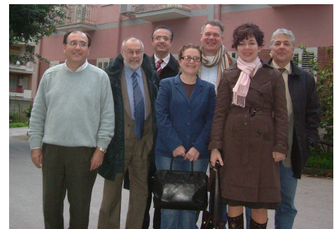
Partners at kick-off meeting