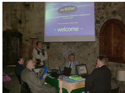
Welcome by Italian host