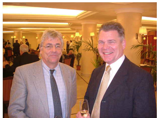
French (left) and Dutch (right) partners at Lions Club Event